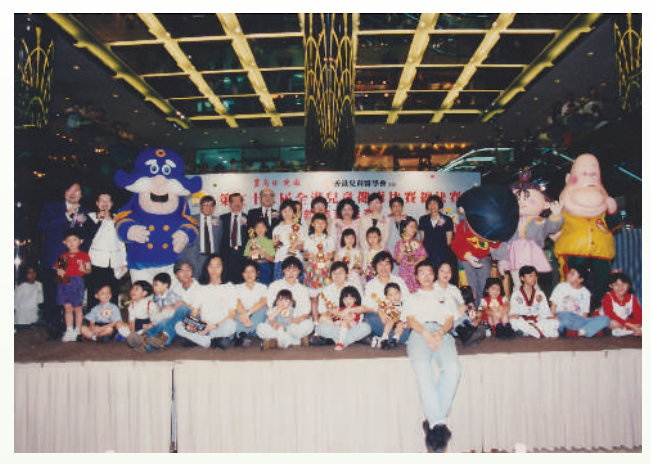
From 1994 at the 32<sup>nd</sup> Hong Kong Healthy Children Competition (HKHCC) HKPF took over to co-organize with Sing Tao Daily

HKHCC was the annual competition jointly organized by HKPS and Sing Tao Daily since early 1960s.