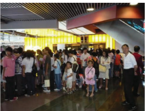
Disneyland Film Show called "五星級大厨" at MegaBox UA on 2 Sep., 2007