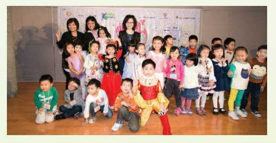
Judges and children performers