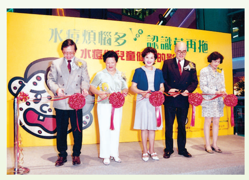
Health Education Exhibitions - Chicken Pox Prevention

Chicken-pox Prevention: 14-15 June 1997, at the Kowloon City Plaza. Exhibition with games for children was again held on 29-30 Nov 1997 at Tuen Mun Town Plaza. 23 – 24 May 1998 at Kowloon City Plaza. Public received with enthusiasm. Educational Pamphlets on chickenpox were enclosed for parents' reference.