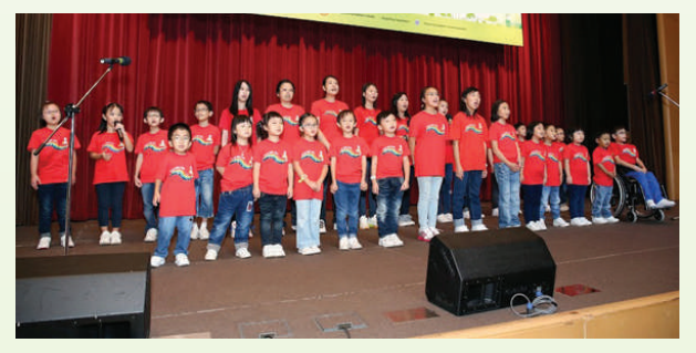
Performance Show -The Little Life Warrior Choir (生命小戰士合唱團)