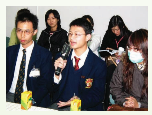
Discussion in the Forum with Students

In collaboration with the BGCA, 3 Forums were held in in Jan, June and October 2005. They are Forum on Education Reform of 3+3+4, Poverty affecting children and Building Healthy Tomorrow respectively. In-depth discussions were held and proposal made.