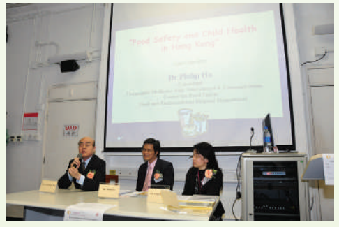
Q & A Session