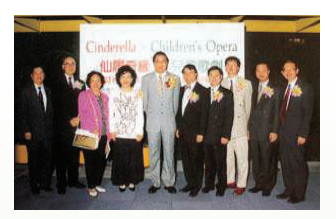
The Cinderella Show

Subsequently, the funding of the Foundation is mainly from the selling of books, donation from philanthropists and by holding Gala Premiere.