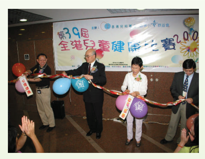
From Year 2002, the annual HKHCC was co-organized by HKPF and the BGCA