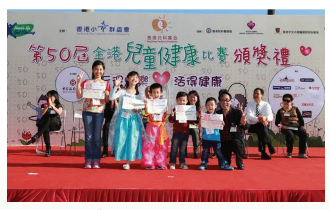
Winners of the 50<sup>th</sup> Hong Kong Healthy Children Competition 2014 Awards

Prize Presentation Ceremony and Carnival on 23 Nov 2014