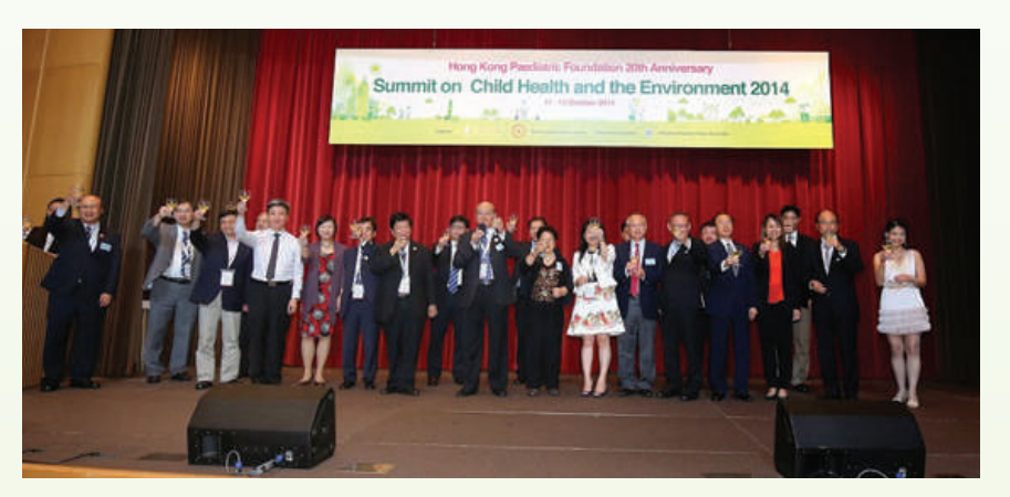
Toasting – Cheers